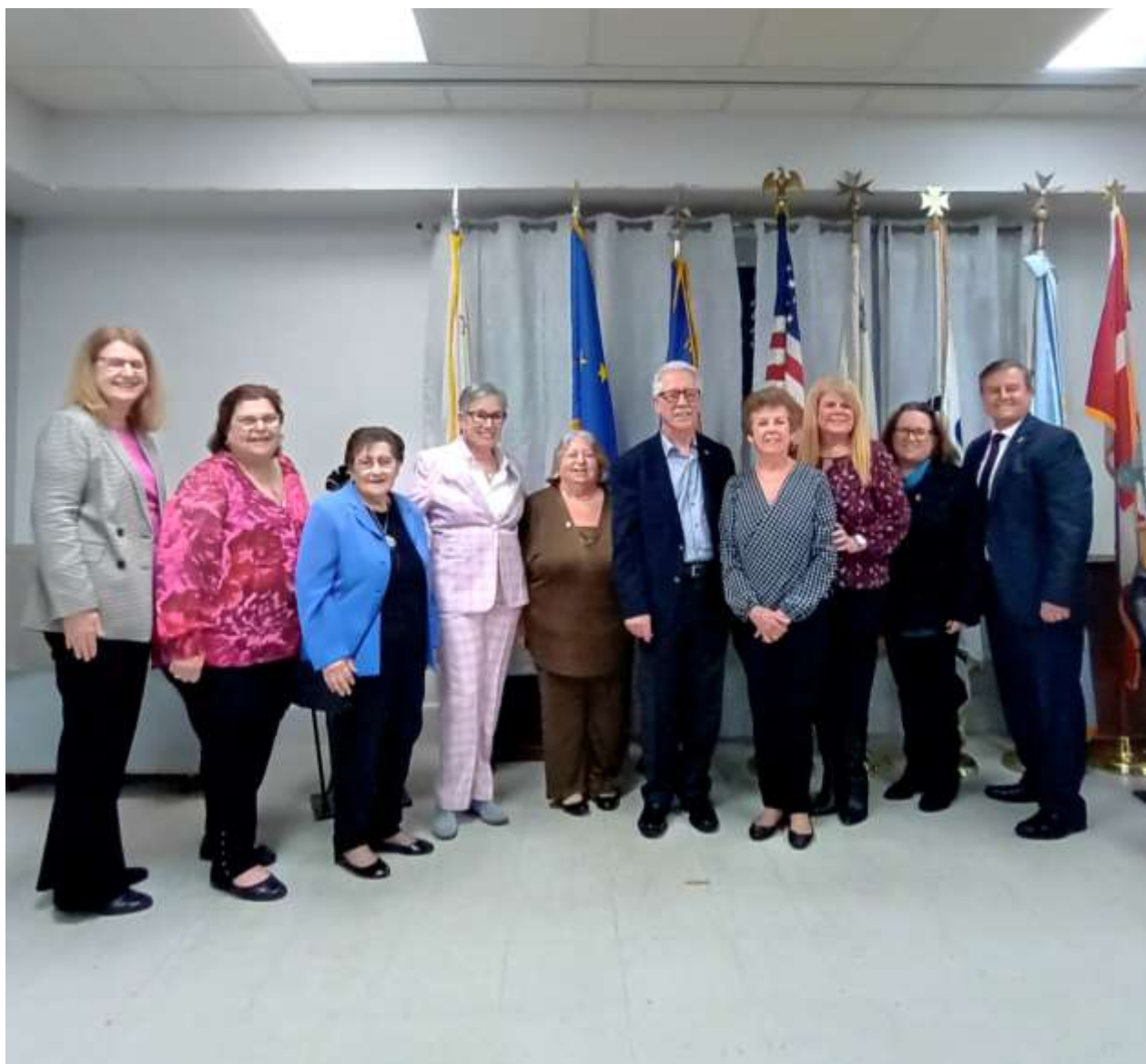
See pages 15-22, 24.