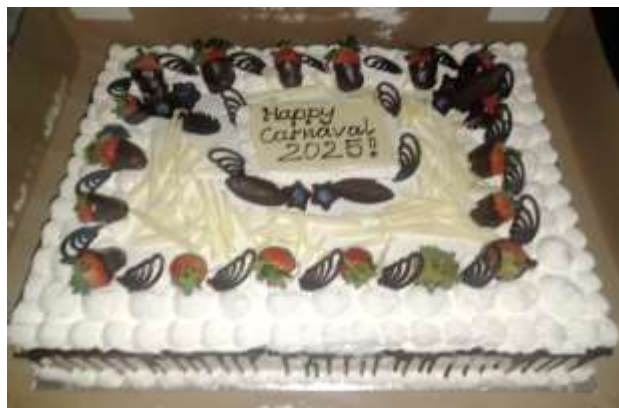
Dessert was strawberry shortcake