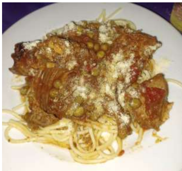
Rabbit on spaghetti was the meal

Fifty people attended our Carnival Dinner Party at the Melita Soccer Club in Toronto, on Saturday, March 1 st .